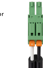
Power Adapter Not required with all carrier boards